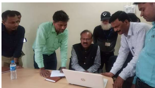
Submitting for Pre-qualifier for NBA with Hon. Joint Director