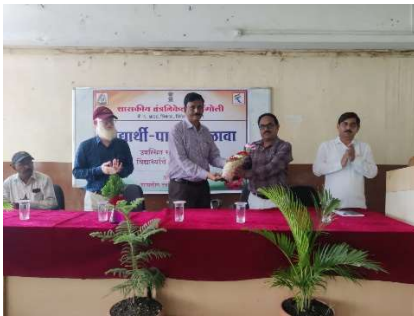
Induction Program for Fresher's