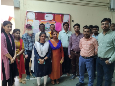
Wall Magazine Inauguration – Developed for the students by the students through Electronics & Telecommunication Student Association (ETSA).